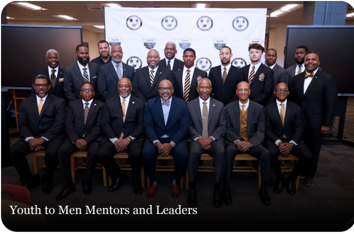
Youth to Men Mentors and Leaders