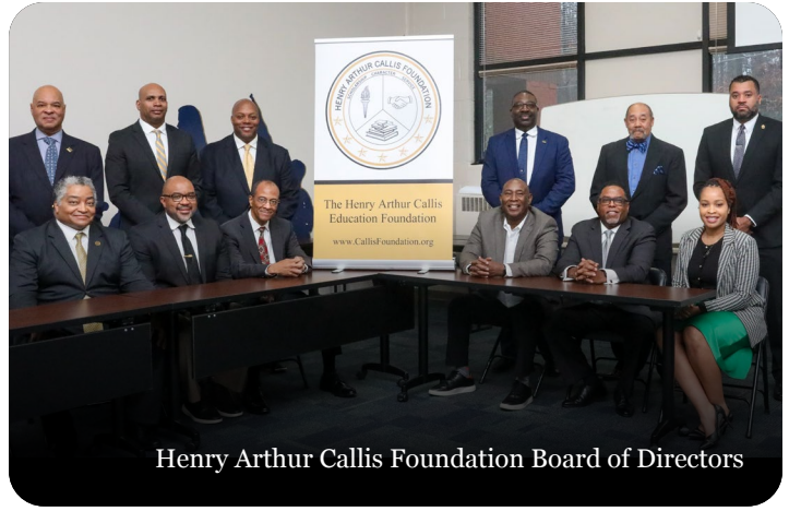
Henry Arthur Callis Foundation Board of Directors